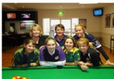
2014 State Ladies Team